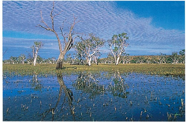
Figure 6. Lewis Creek Floodout showing spiny mudgrass and Eucalyptus victrix trees, with Denison Range in background (K. Coate)