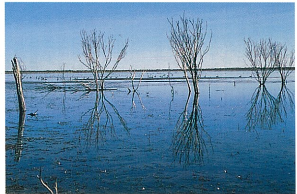
Figure 7. Lake Willson 1995 (K. Coate)