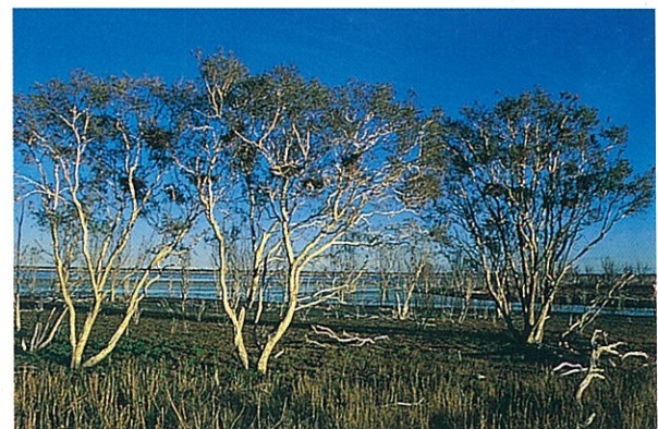
Figure 8. Lake Willson 1995, showing disused nests of Little Black Cormorant in Melaleuca glomerata trees (K. Coate)