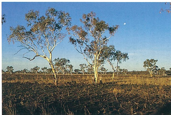
Figure 4. Granny Soak (K. Coate)