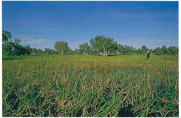
Figure 5. Lewis Creek Floodout (K. Coate)