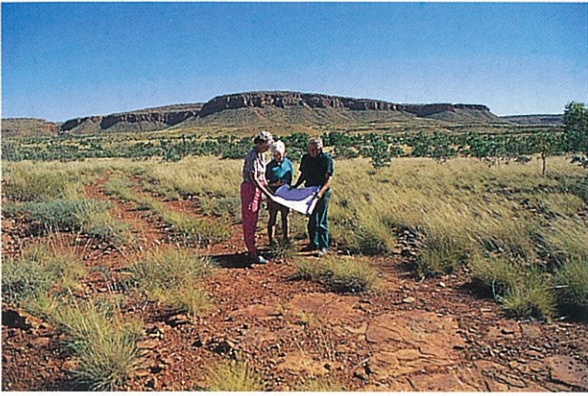
Figure 1. Gardner Ranges (K. Coate)