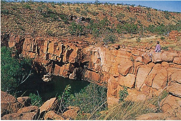
Figure 2. Large permanent rockhole within the Gardner Range (K. Coate)