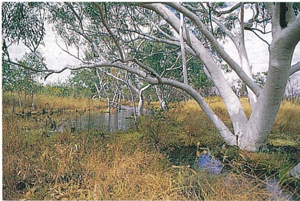
Figure 3. Mt Brophy Spring (K. Coate)