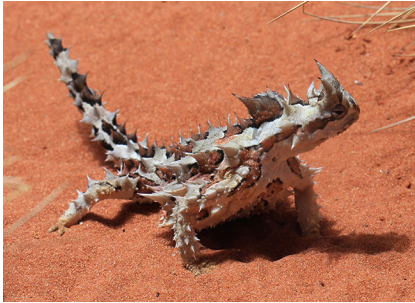
Thorny devil, in the reptile house at Alice Springs Desert Park, Australia. Stu's Images [CC BY-SA 4.0], via Wikimedia Commons.

Thorny devils scampering across the baking red Australian sand in search of an ant dinner look almost invincible in their coat of spikey armour, but their choice of diet may make survival even more challenging in the harsh environment. Philipp Comanns from RWTH Aachen University, Germany, explains that the lizards' mouths are so well adapted to consuming ants that they are unable to lick water to drink. However, the resourceful animals have a remarkable alternative strategy to overcome the drinking challenge: they have effectively turned the entire surface of their skin into a drinking straw.